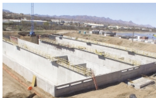
Nogales International WWTP, Rio Rico, Ariz.

PCL was named one of Fortune magazine's "100 Best Companies to Work For" in 2006 and 2007.