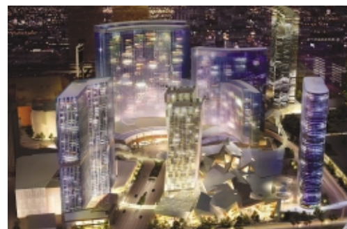
CityCenter, Las Vegas

On top of managing over 350 subcontractors and 7,000 tradespeople at CityCenter alone, Perini is helping to pave the way for minority and women-owned subcontractors through its diversity programs. Since 2005, Perini has awarded $480 million of contracts to wbe/mbe/dbe firms at the project.