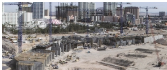
Echelon, Las Vegas