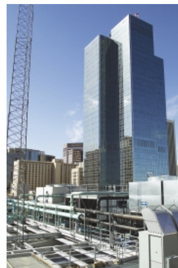
Digital Realty Trust, Phoenix

DPR is currently working on the $45 million Sanofi-aventis Research Center in Oro Valley, which is expected to achieve LEED certification.