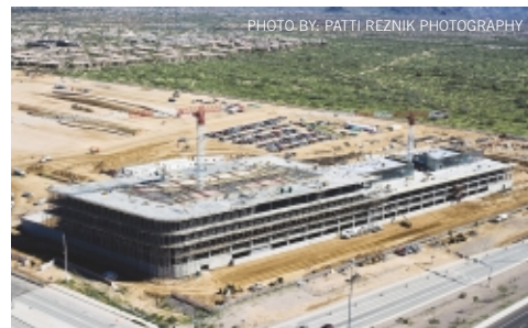
Dial Corp. Headquarters, Scottsdale