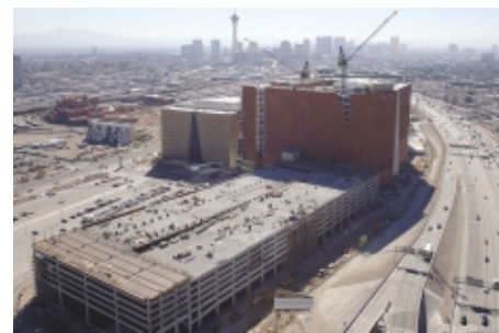
World Market Center, Building C, Las Vegas

Established in 2000, Penta recently opened offices in Reno and Palm Springs, Calif.