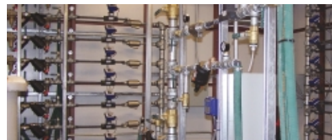
North RR Ave Plume Superfund Site

RMCI completed several hazardous waste projects in 2007, including the $1.9 million North RR Avenue Plume Superfund Site in Espanola, N.M. Construction included installation of a 2,200-ft pipeline, three process vault and a pump and treatment building.