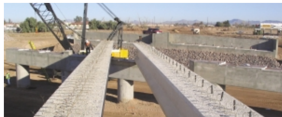
Ellsworth Loop Project, Queen Creek

FNF is highly involved with the Del E. Webb School of Construction program at ASU and the cancer-focused City of Hope.